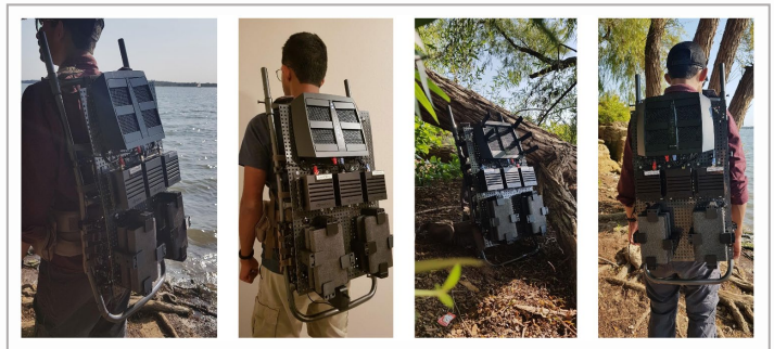
The wearable computing backpack shown in a variety of outdoor environments.